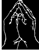
Buddha Shrine Mudra

First homage to the Root Guru and all Buddhas in all times and directions ( Using Buddha Shrine Mudra)